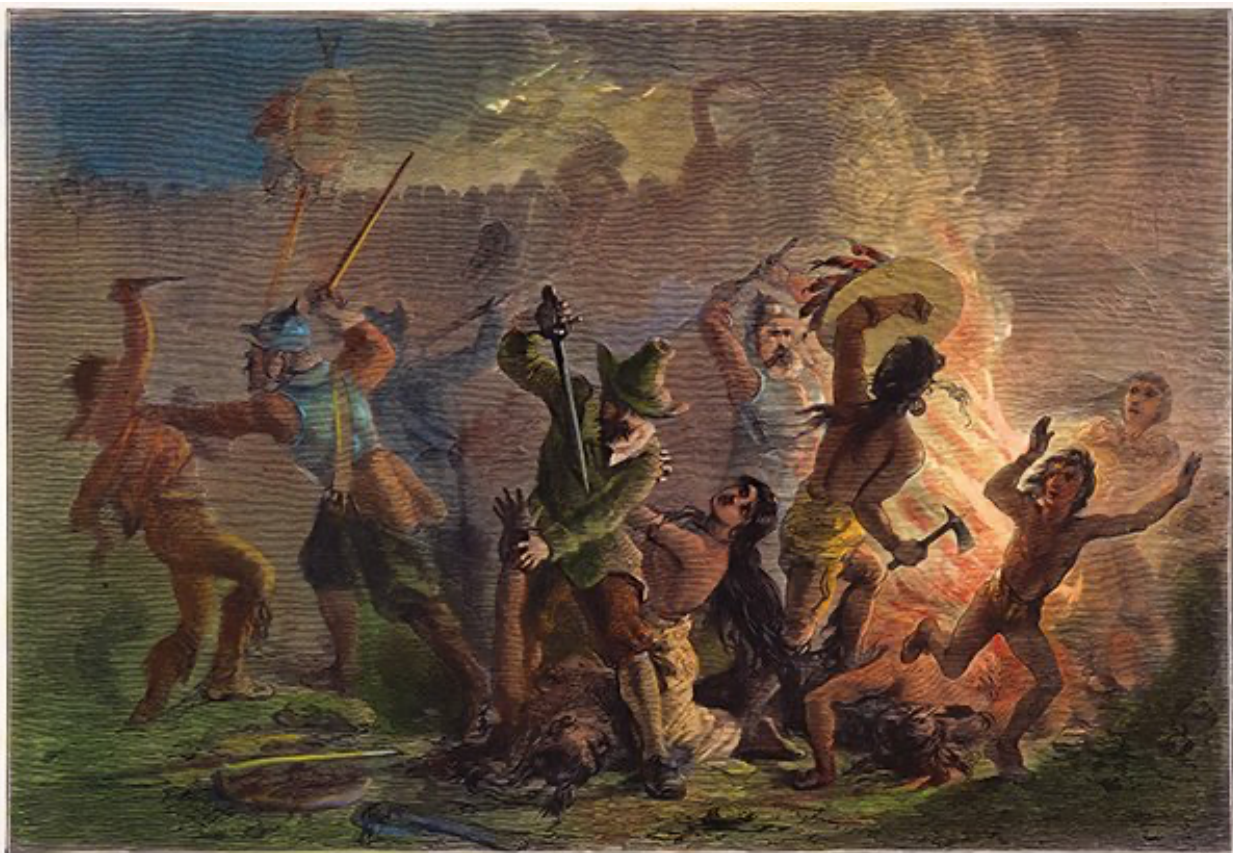
DESTRUCTION OF THE PEQUOTS

‘ unholy vanity ’ has driven many Willful Protestants in History from Disobedience to Death.”